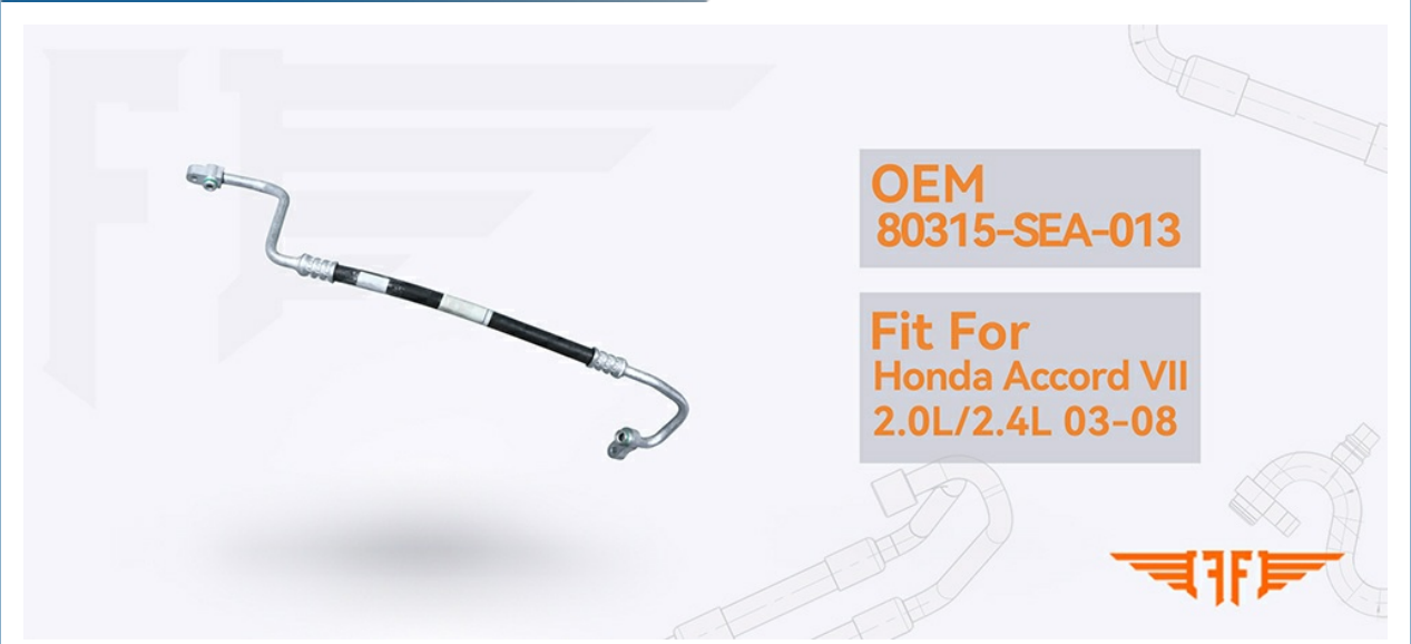
80315-SEA-013 Discharge AC pipe HondaAccord VII Fits For 2.0/2.4L 03-08