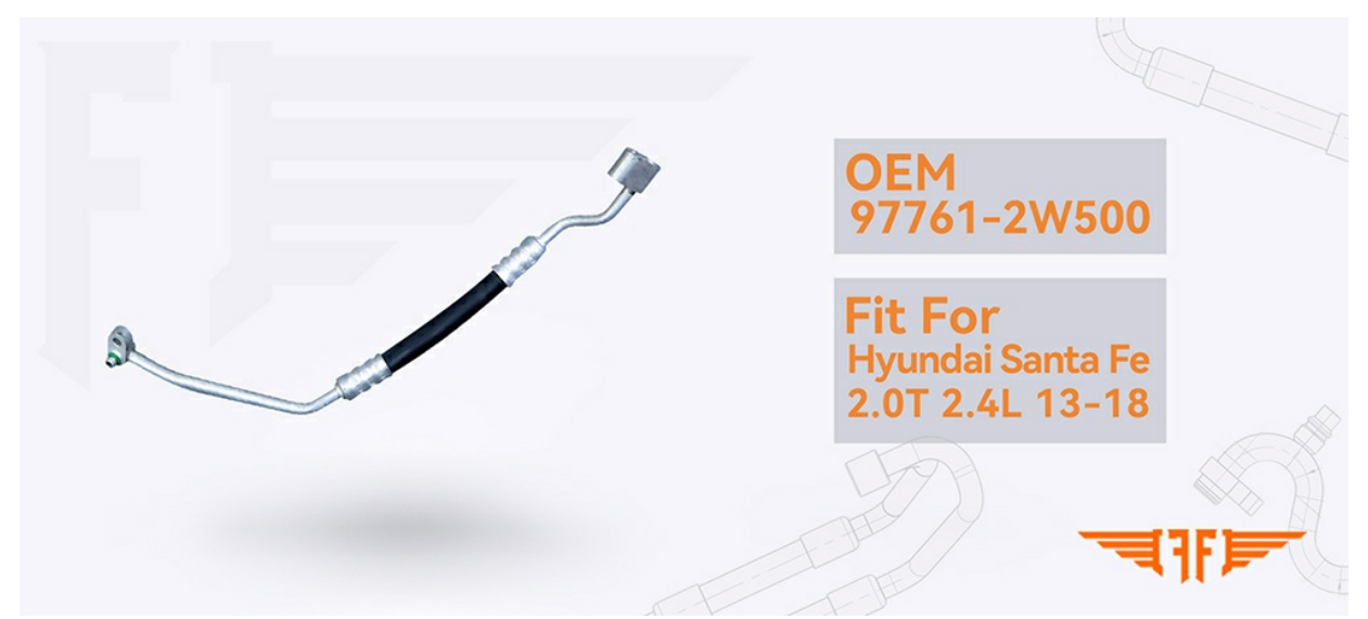
97761-2W500 Discharge AC Pipeline Fits For 13-18 Hyundai Santa Fe 2.0T 2.4L