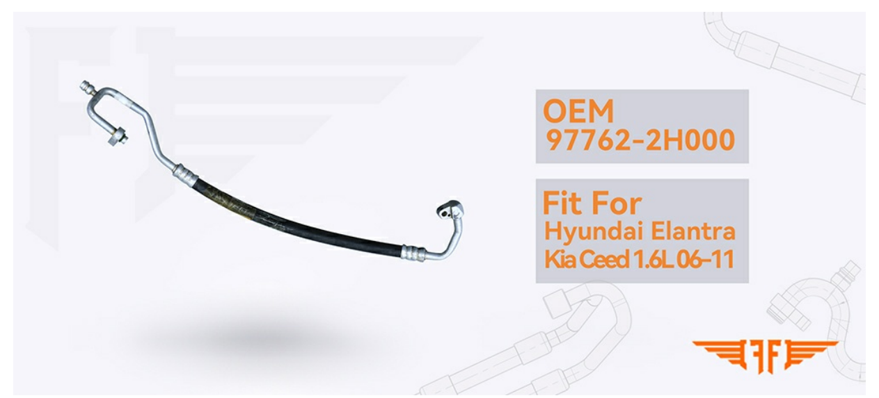
Discharge AC Pipe Hyundai Elantra Kia Ceed 1.6L 06-11 OEM 97762-2H000